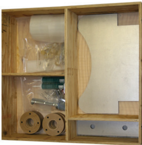
Electrode Clamp Insulation Kit

There is no standard design or arrangement; every kit is a customized assembly based on the requirements of the melt shop's personnel. The Gund Company offers technical assistance during the planning stages, helping to create a customized kit and replacement program that best fits the customer's needs.