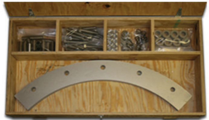
Bottom Electrode Insulation Kit

Click to go back to the metals applications page