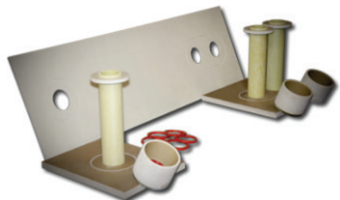
Mast Arm Insulation Kit